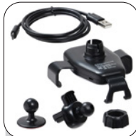
Includes charging cable, mounting clip and adhesive stand.