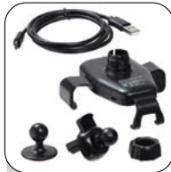
Includes charging cable, mounting clip and adhesive stand.