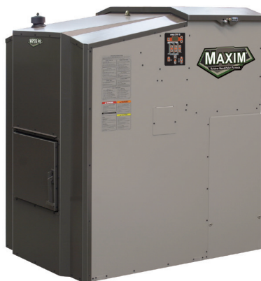
TERRA BROWN / TAUPE (textured finish)