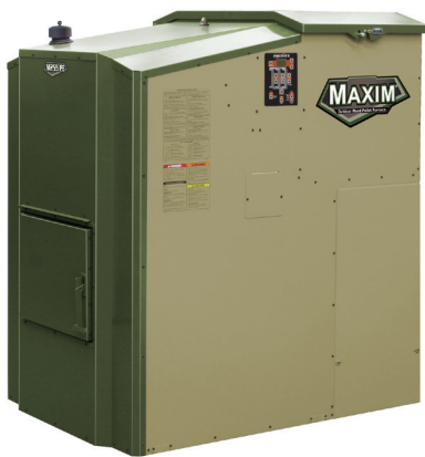
GREEN / OLIVE GRAY

Included with furnace: Water Test Kit, Cleaning Rod, Flue Brush Kit, Ground Rod Kit, Ash Scoop, Rain Cap and two 4-foot chimney sections