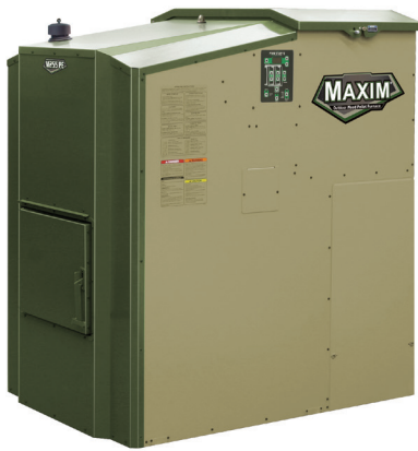
GREEN / OLIVE GRAY

Included with furnace: Water Test Kit, Cleaning Rod, Flue Brush Kit, Ground Rod Kit, Ash Scoop, Rain Cap and two 4-foot chimney sections